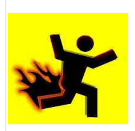
3 Tricky Dick