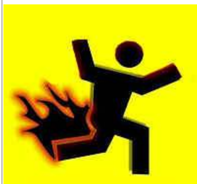
3 Tricky Dick